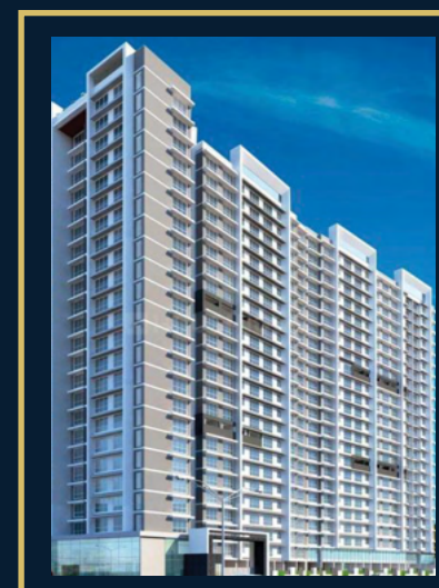
SETHIA KALPAVRUKSH HEIGHTS