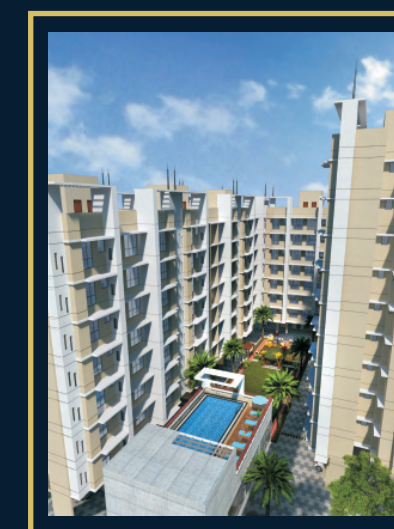
SETHIA GREEN VIEW