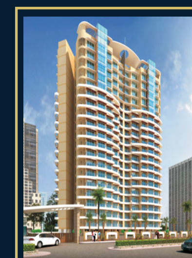
SETHIA LINK VIEW