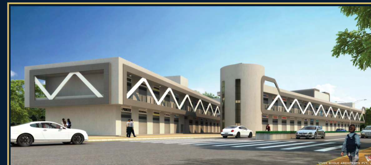
SETHIA INDUSTRIAL PARK