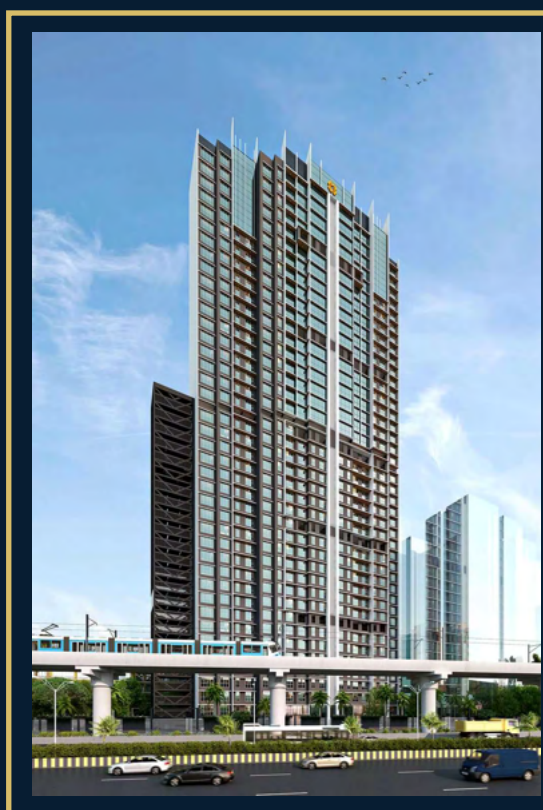
SETHIA IMPERIAL AVENUE