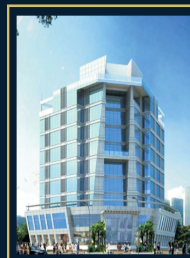
SETHIA CENTER PLAZA