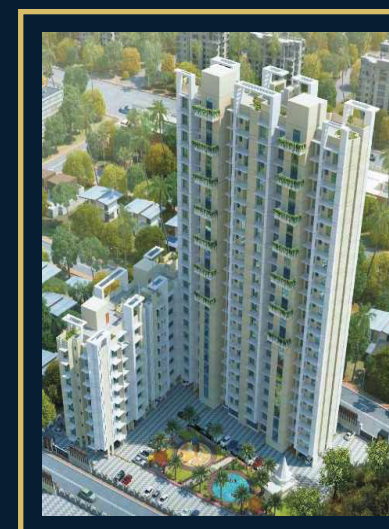
SETHIA SEA VIEW